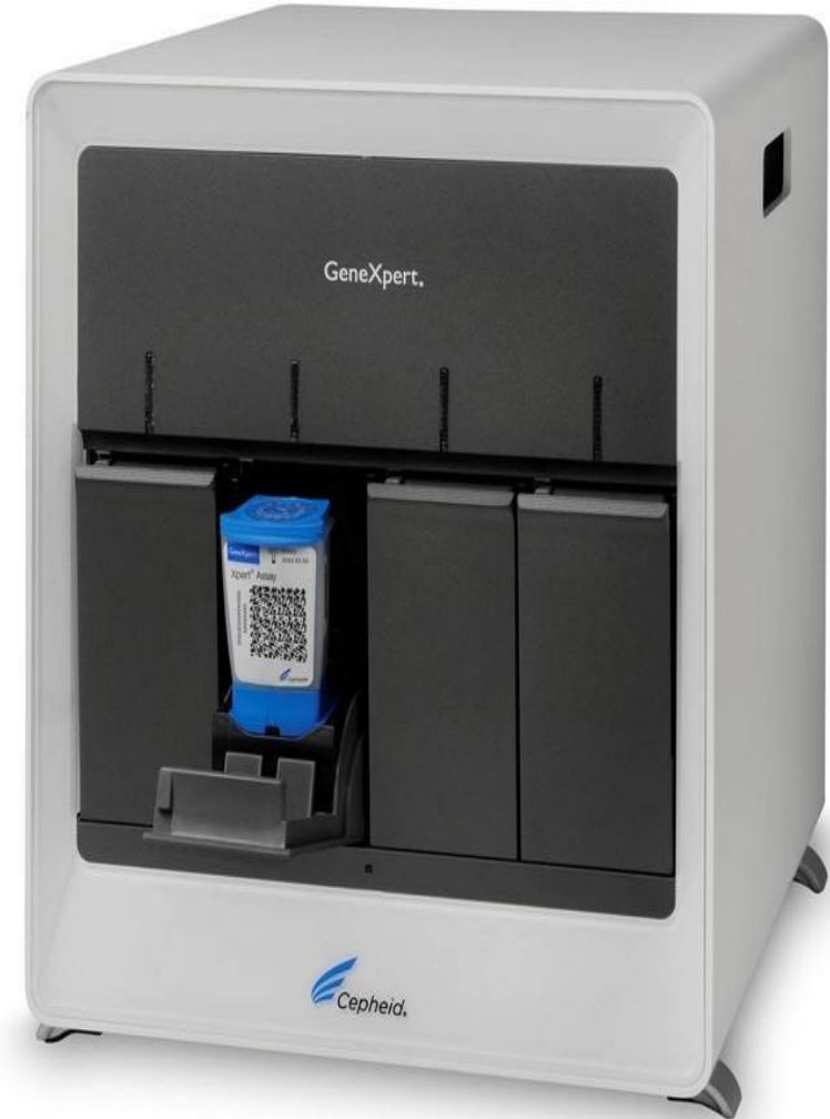
GeneExpert Omni Instrument

Many approaches use a combination of digital technologies and may rely on telecommunications infrastructure and internet availability. Machine learning is shown as a separate branch for clarity, although it also underpins many of the other technologies. Much of the data generated from these technologies feeds into data dashboards. SMS, short message service.