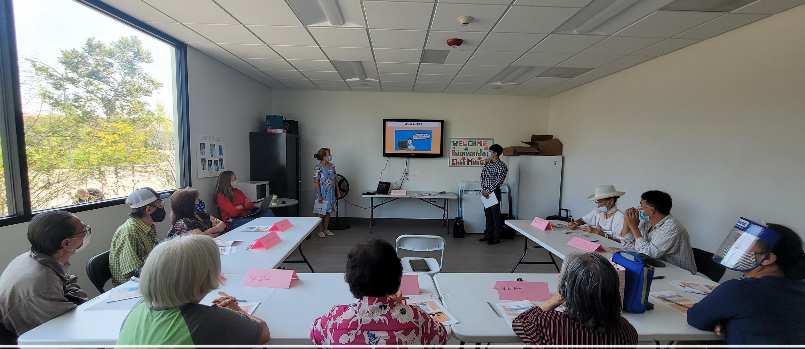
Vietnamese focus group with Bayside Community Center